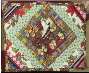
Vicky Kidd: 2 Placemats. Quilted by Vicky Kidd. Quilt as you go Christmas placemats.